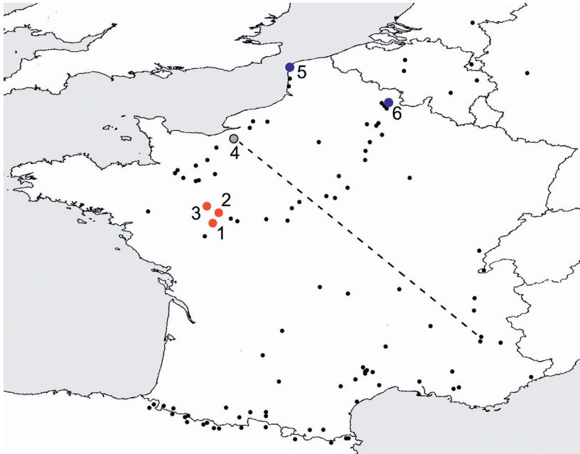
Fig. 1. Sampling localities of Bufo bufo (blue) and B. spinosus (red) in France: 1) Saumur (n=12); 2) Perré (n=8); 3) Durtal (n=8); 4) Moyaux (n=22); 5) Audresselles (n=14); 6) Erloy (n=20). The population at Moyaux (open circle) is identified as a B. bufo x B. spinosus hybrid population (see results). Black dots represent populations studied in Arntzen et al. (2013b), whereas the dashed line represents the contact zone as approximated in that study.

and B. spinosus in France (Arntzen et al. , 2013a, b, 2014). The results show an overall correspondence between morphology and molecules and congruence across molecular markers, with occasional discordance interpreted as resulting from incomplete lineage sorting, although hybridization-mediated gene flow cannot be ruled out.